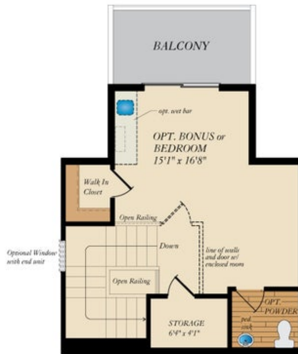
OPT. LOFT W/ POWDER ROOM