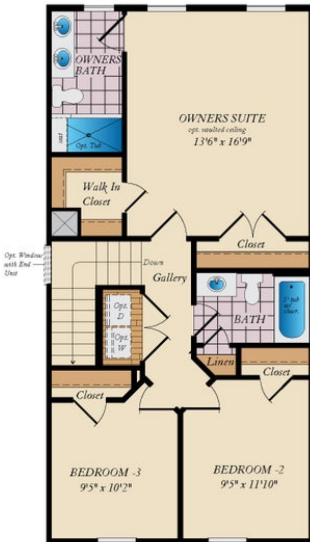
STD. SECOND FLOOR PLAN