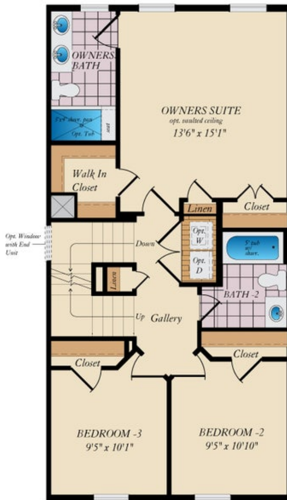
STD. SECOND FLOOR PLAN W/ OPT. LOFT'S STAIR