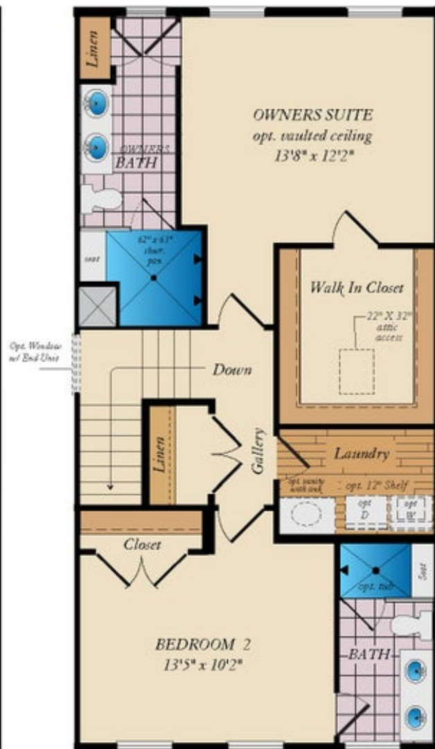
OPT. DUAL OWNERS SUITES