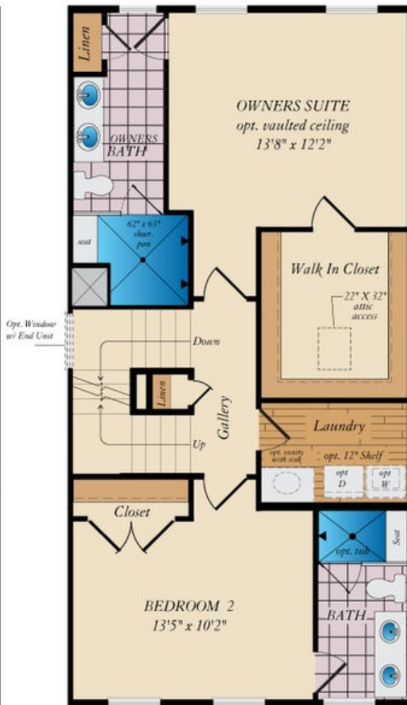
OPT. DUAL OWNER SUITES W/ OPT. LOFT'S STAIR