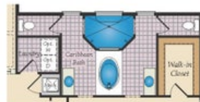
OPT. CARIBBEAN BATH

Brick/stone fronts, chimneys, bay windows, keystones, exterior trim, garage doors, light fixtures, dormers, and gables shown on elevations are optional features. Actual product specifications may vary in dimension or detail from these drawings. This insert is for illustrative purposes only and is not part of the legal contract. All dimensions are approximate. Many available options are not shown.