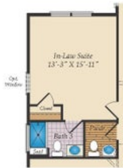
OPT. IN-LAW SUITE