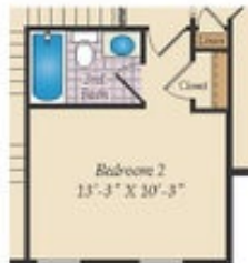
OPT. 3RD BATH