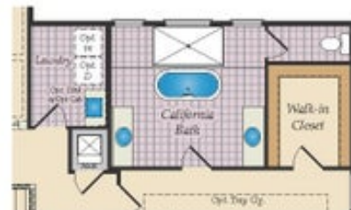
OPT. CALIFORNIA BATH