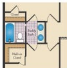
OPT. BUDDY BATH