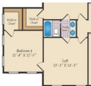
OPT. CONSERVATORY BELOW