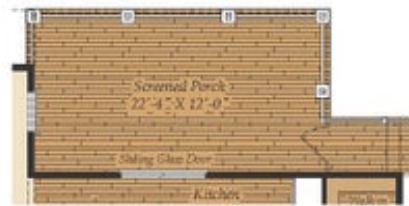
OPT. SCREENED PORCH