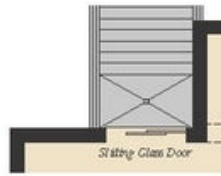
OPT. DOUBLE AREAWAY