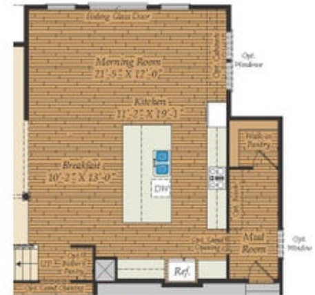
OPT. MORNING ROOM (Shown with Opt. Deluxe Kitchen)