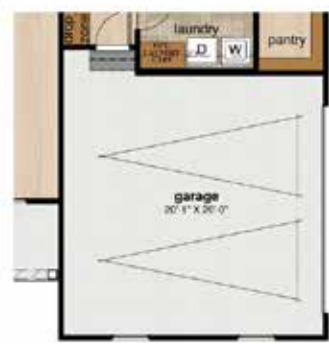
Optional Side Entry Garage