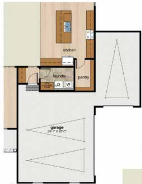
Optional 3-Car Side Entry Garage