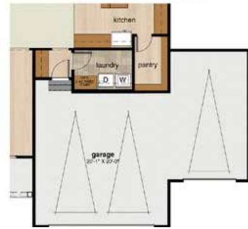
Optional 3-Car Front Entry Garage