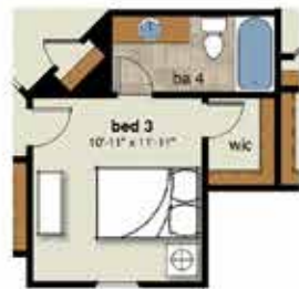
Optional Bath 4 Second Floor