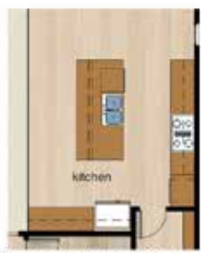
Optional Gourmet Kitchen