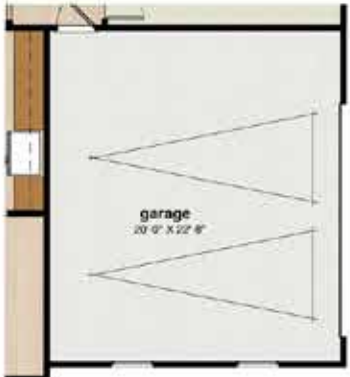
Optional 2-Car Side Entry Garage