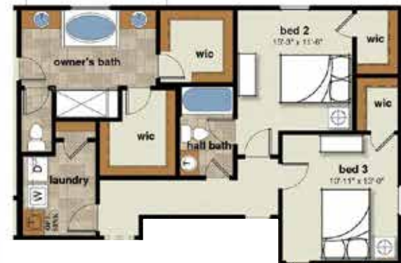
Optional Owner's Bath

Actual product specifications may vary in dimension or detail from these drawings. This insert is for illustrative purposes only and is not part of the legal contract. All dimensions are approximate. Many available options are not shown. Please see community Sales Manager for details 7/2018