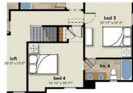
Optional Bath 4