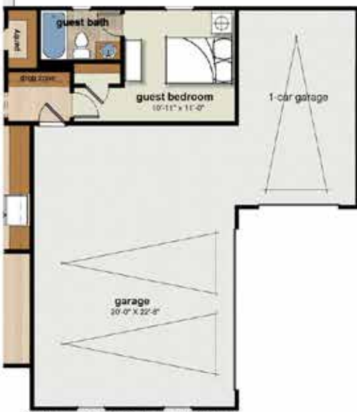
Optional 3-Car Side Entry Garage