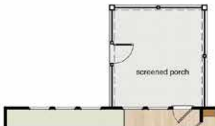
Optional Screened Porch