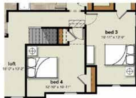
Optional Stairs to 3rd Floor