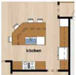
Optional Gourmet Kitchen