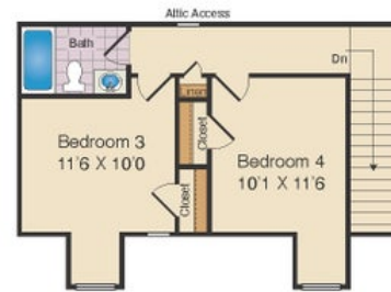
Optional Finished Second Floor

These floor plan and elevations are illustrations of an artist's conception of the home and may vary in detail from specifications and/or the actual home and may be shown with options. Variations may occur due to such reasons as, but no limited to, changes made during construction process, availability of materials, our continued improvement process, etc. Room dimensions and square footage are approximate. There may be many other available options not shown. This document is for illustrative purposes only and is not part of a legal contract. 10-20-22