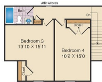
Elevation 3 - Optional Finished Second Floor