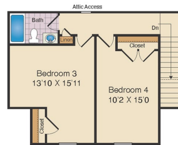
Elevation 3 - Optional Finished Second Floor