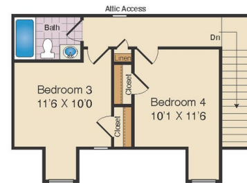
Optional Finished Second Floor

These floor plan and elevations are illustrations of an artist's conception of the home and may vary in detail from specifications and/or the actual home and may be shown with options. Variations may occur due to such reasons as, but no limited to, changes made during construction process, availability of materials, our continued improvement process, etc. Room dimensions and square footage are approximate. There may be many other available options not shown. This document is for illustrative purposes only and is not part of a legal contract. 10-20-22