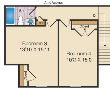
Elevation 3 - Optional Finished Second Floor