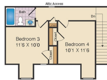
Optional Finished Second Floor

These floor plan and elevations are illustrations of an artist's conception of the home and may vary in detail from specifications and/or the actual home and may be shown with options. Variations may occur due to such reasons as, but not limited to, changes made during construction process, availability of materials, our continued improvement process, etc. Room dimensions and square footage are approximate. There may be many other available options not shown. This document is for illustrative purposes only and is not part of a legal contract. 10-20-22