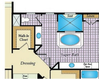
OPT. SUPER BATH