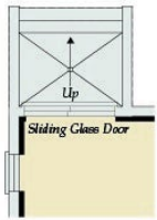
OPT. DOUBLE AREAWAY