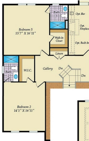
OPT. BEDROOM 5 & BATH 5