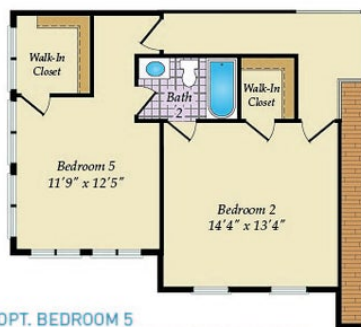
OPT. BEDROOM 5 W/ OPT. FIRST FLOOR CONSERVATORY