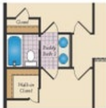
OPT. BUDDY BATH