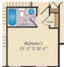
OPT. 3RD BATH