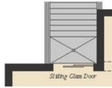
OPT. DOUBLE AREAWAY