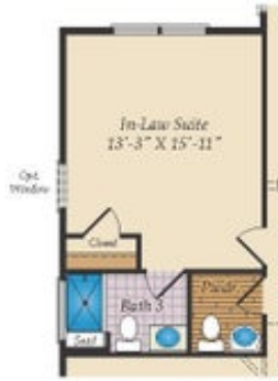
OPT. IN-LAW SUITE