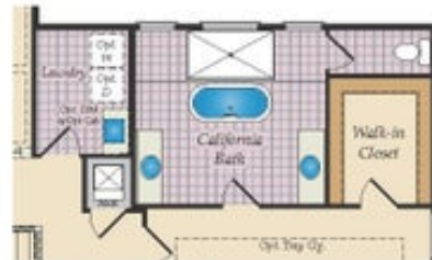
OPT. CALIFORNIA BATH