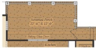
OPT. SCREENED PORCH