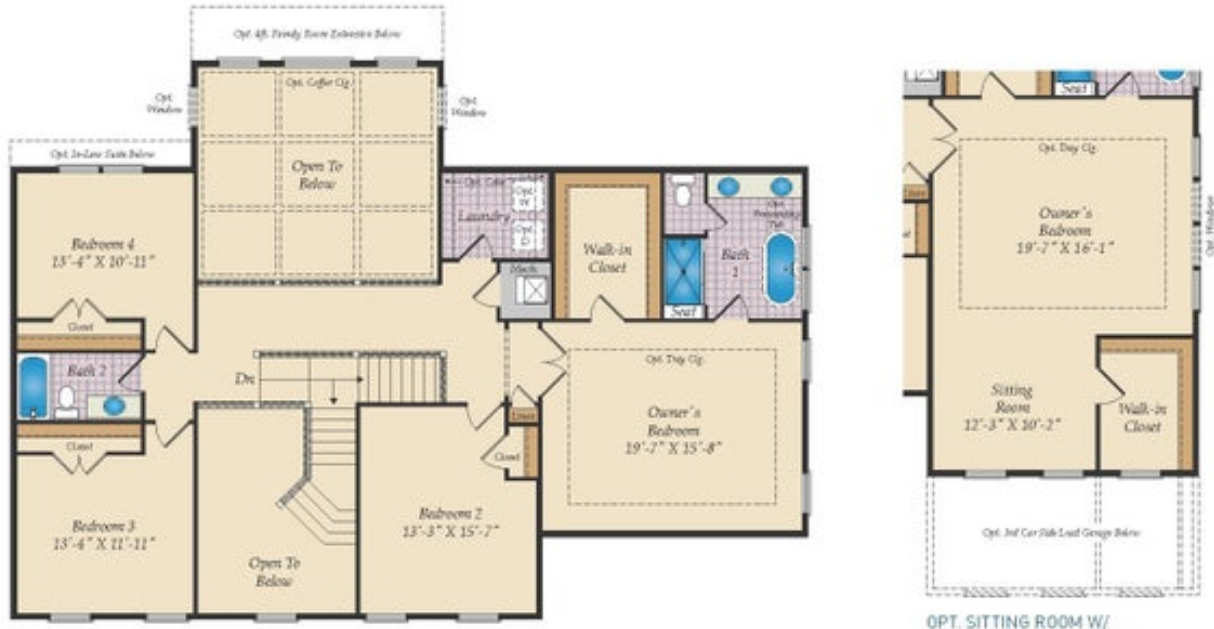
OPT. SITTING ROOM W/ 2 CAR SIDE LOAD GARAGE