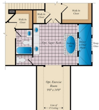
OPT. SUPER BATH W/ OPT EXERCISE ROOM