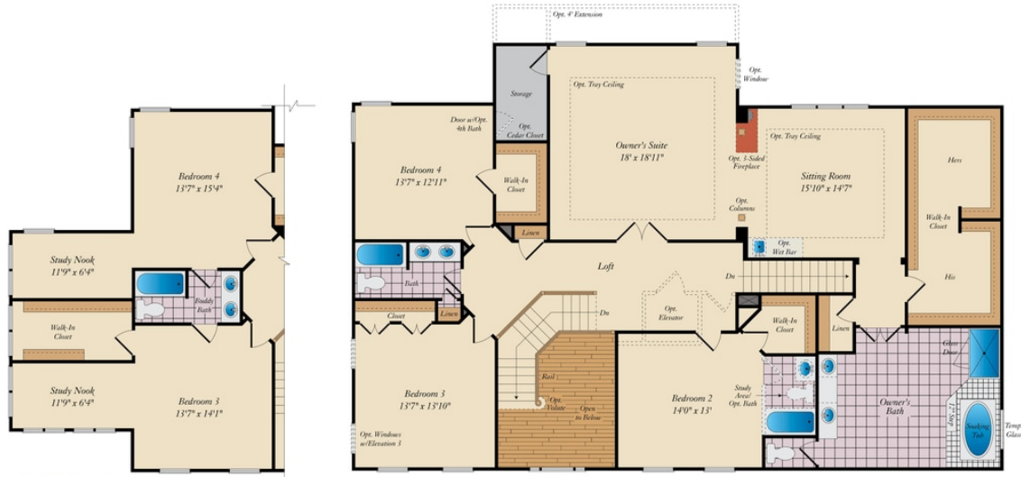
OPT. BUDDY BATH WITH OPT. 2-STORY CONSERVATORY