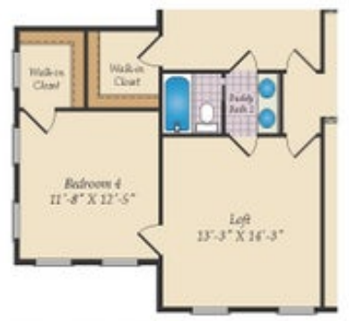
OPT. CONSERVATORY BELOW