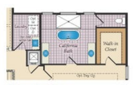
OPT. CALIFORNIA BATH