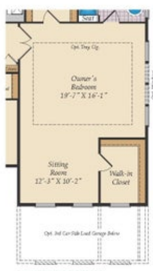
OPT. SITTING ROOM W/ 2 CAR SIDE LOAD GARAGE