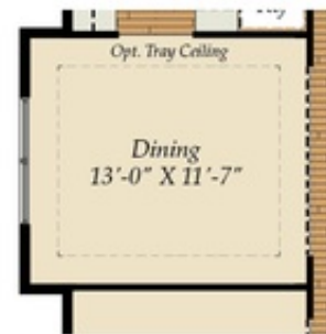
OPT. BOX BAY AT DINING