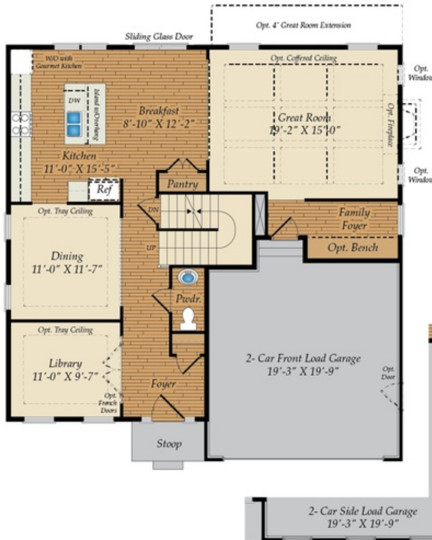
OPT. SIDE LOAD GARAGE