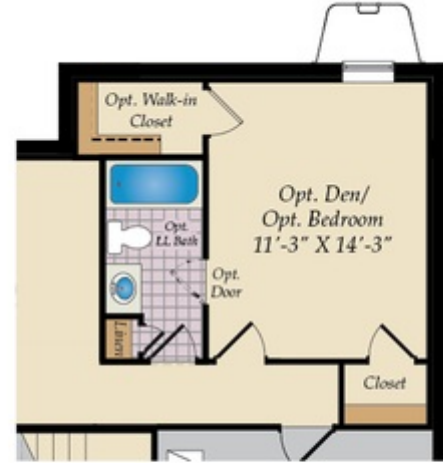
OPT. EXTENDED DEN