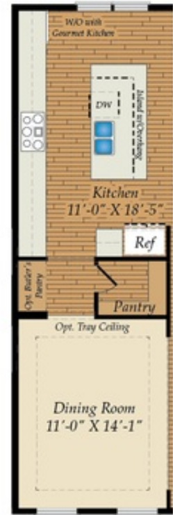
OPT. EXTENDED KITCHEN