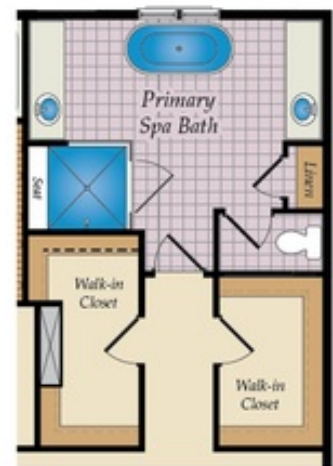
OPT. PRIMARY SPA BATH