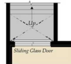
OPT. DOUBLE AREAWAY