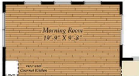
OPT. MORNING ROOM