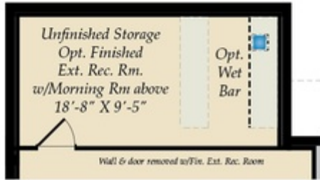
OPT. UNFINISHED STORAGE/OPT. FINISHED EXT. REC. RM. W/MORNING ROOM ABOVE