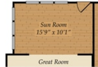
OPT. SUN ROOM