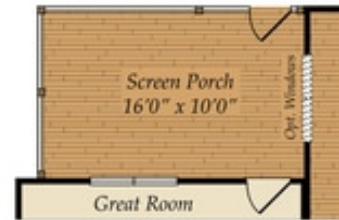
OPT. SCREEN PORCH