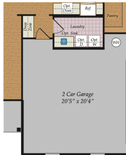
OPT. SIDE LOAD GARAGE