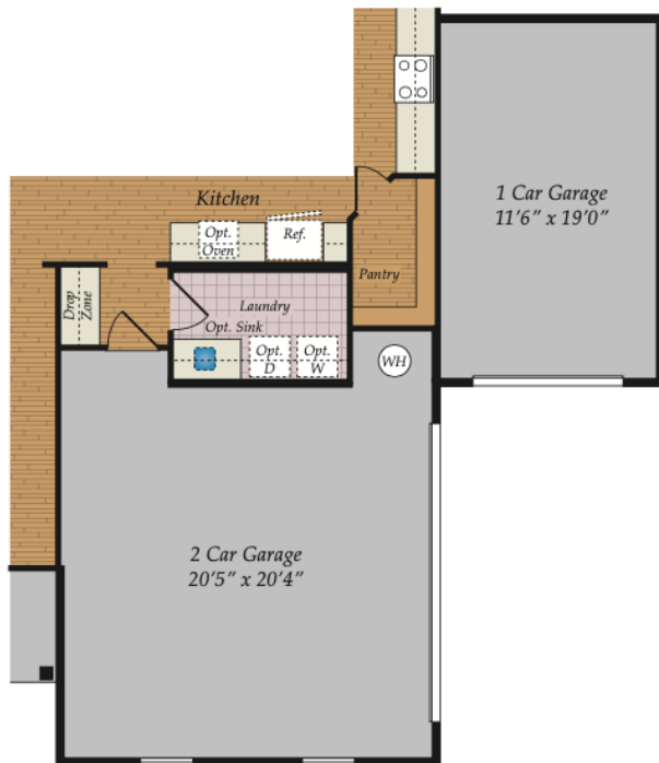
OPT. 3RD GARAGE