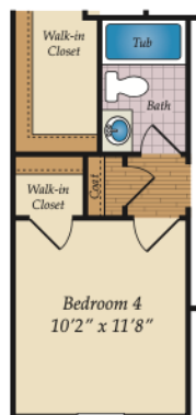
OPT. BEDROOM 4 W/ POWDER ROOM