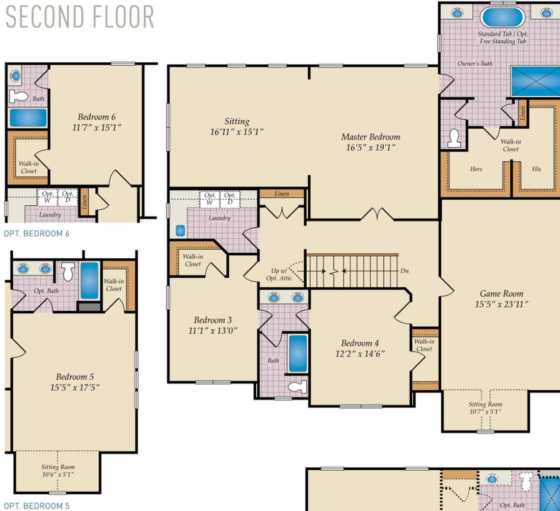
OPT. BEDROOM 6