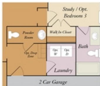
OPT. FULL BATH W/ BEDROOM 3