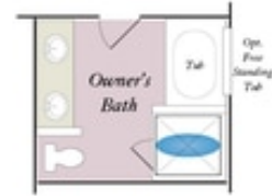
OPT. OWNERS BATH W/ TUB AND SHOWER