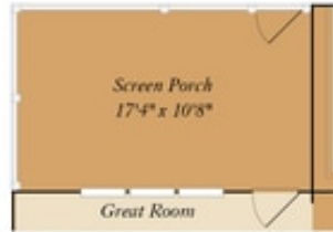
OPT. SCREEN PORCH