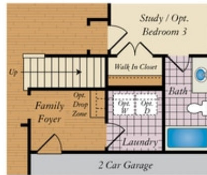
STAIRS TO SECOND FLOOR AND OPT. FULL BATH W/ BEDROOM 3