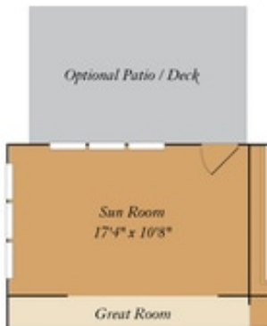
OPT. SUN ROOM