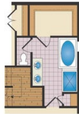
Opt. Super Bath w/ Loft