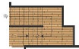
Opt. Stairs w/ Opt. Loft