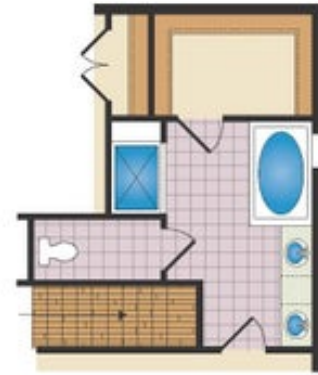
Opt. Super Bath