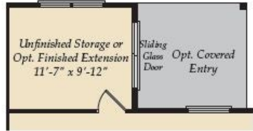
OPT. LOWER LEVEL EXTENSION (ONLY WITH SUNROOM)