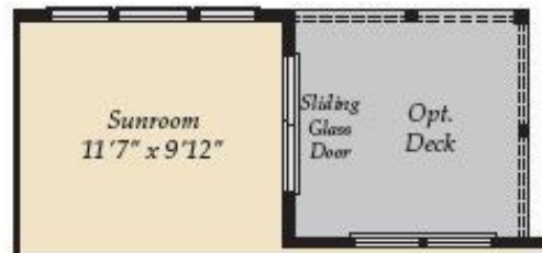
OPT. SUNROOM IN THE FIRST FLOOR PLAN (INCLUDES LOWER LEVEL EXTENSION)