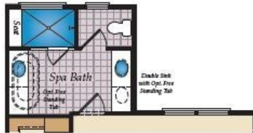
OPT. SECOND FLOOR ONLY W/SUNROOM AND LOWER LEVEL EXTENSION